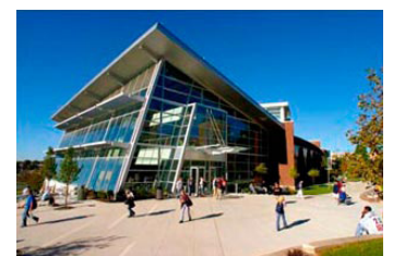
University of Akron Campus