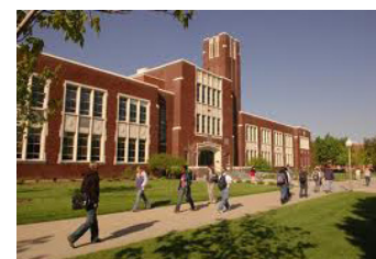
Boise State University Campus