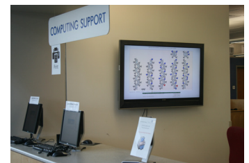
LabMaps display at FGCU